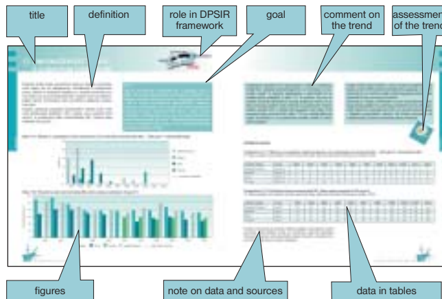
Figure 2: The demonstration of selected indicators and its structure

For the purposes of preparing the "Environmental Indicators" publication numerous data were collected that was taken from the databases of both the EARS as well as sources maintained at other relevant institutions (e.g. the Statistical Office of the Republic of Slovenia, the Agency of the Republic of Slovenia for Agricultural Markets and Rural Development, the Chamber of Commerce and Industry of the Republic of Slovenia, etc.). The reports obtained through the data analysis and integration, and accompanied by expert opinions may serve as a support for decision-makers in their political deliberations. Furthermore, they may also present an integral part of the public's right to be informed on the state of the environment and the efficiency of environmental policies.